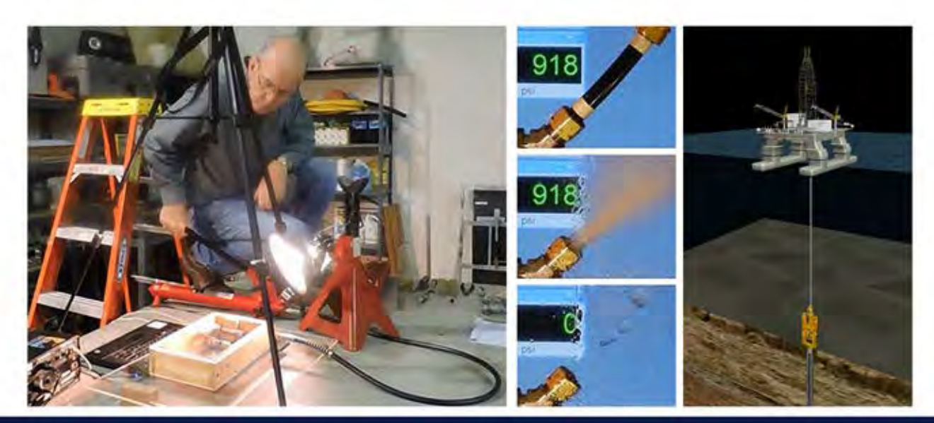
FIFTY YEARS OF PROCESS DEVELOPMENT, FIFTY YEARS EVOLVING SKLLL SETS, FIFTY YEARS OF NETWORK BUILDING, FIFTY YEARS AT THE FOREFRONT OF FORENSIC TECHNOLOGY...

ATA takes great pride in our thorough investigative processes and testing protocol development. We start with our comprehensive on-site quick response services, coupled with our own in-house research, testing and analysis capabilities. Between the equipment and facilities available here at our own ATA Technolgy Center and input from the nationwide members of our ATA Products Liability Team; we arm our clients with a diverse and complete set of resources that they can carry forward into the litigative process. Call ATA today - and make things happen!